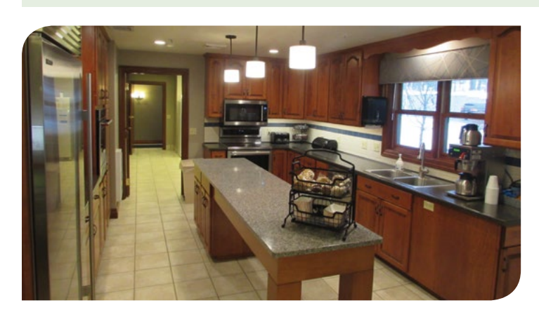
Hospice House kitchen after recent renovation.